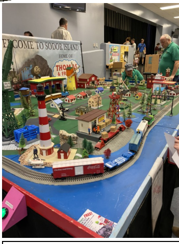
Above: The Villages Model Railroad Club with their Thomas the Tank Engine display