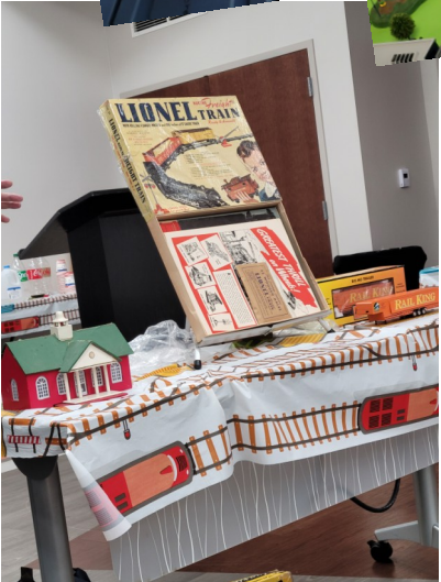
Above: Richard Tashjian's Lionel Wartime Fiberboard Freight Train ("No Vital Wartime Materials Used")