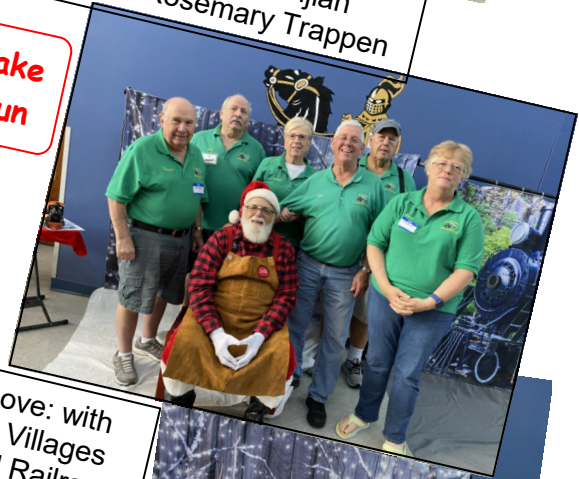
Above: with The Villages Model Railroad Club